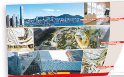
Central double page